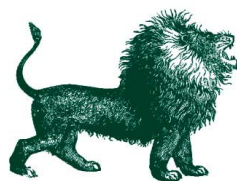
East Africa Safari Ventures

14. Governing Law -This agreement shall be governed by and construed in all respects in accordance with the Laws of Kenya, and each party shall hereby submit to the non-exclusive jurisdiction of Kenyan Courts.